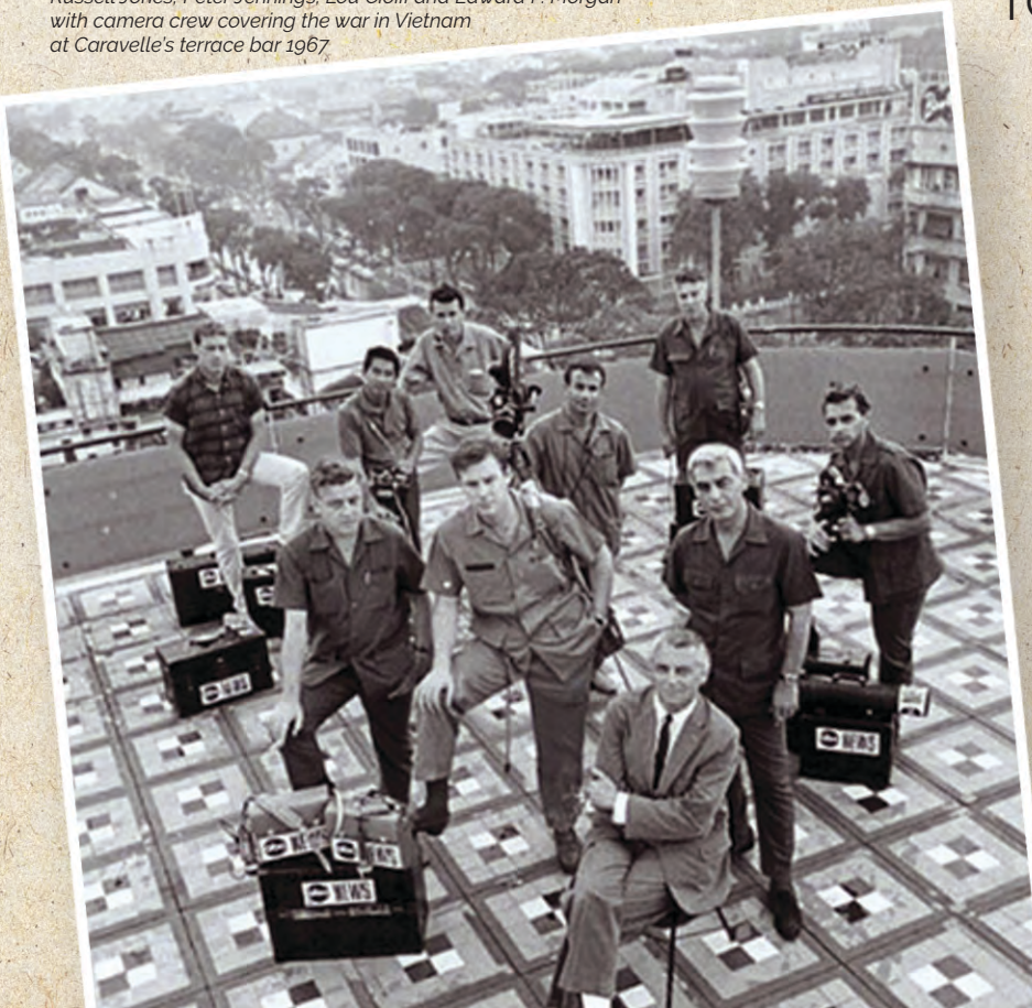
Caravelle's terrace bar in the 1960s